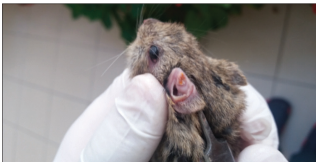
Fig 2. A Gunther's vole ( M. guentheri ) with chigger mite larvae in the external ear canal

Mites of the family Trombiculidae, commonly known as 'chigger mites' or 'chiggers', comprise one of the largest families of the Acari, with more than 3,000 known species across the world. This ectoparasitic family displays its