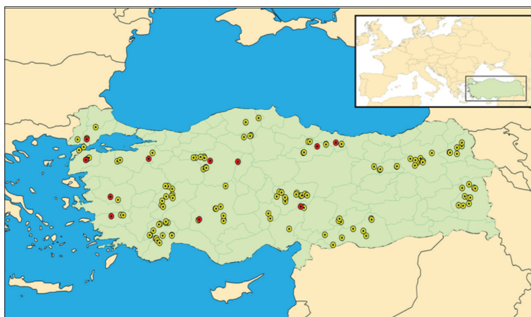
Fig 1. Distribution of the sampled sites for collecting chigger mites in Turkey; ● Present; ○ Absent

Overall, the infestation rate of potential hosts by chigger species was (88/716; 12.3%). In the present study, the most commonly infested body part of the hosts was the external ear canal (Fig. 2). The scutal measurements of all of the