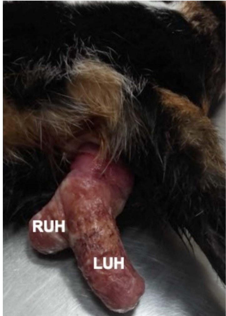
Figure 1. The appearance of the prolapsed uterus. The right uterine horn (RUH) and the left uterine horn (LUH).

parameters were within reference values (Table 1). Abdominal ultrasonography revealed that the kidneys were pulled caudally and moved away from their normal anatomical position, and the bladder was in place.